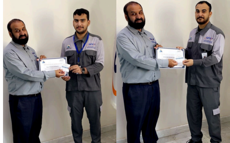
A scene from the honoring of HESCO Company's third batch trainees distinguished in attendance.