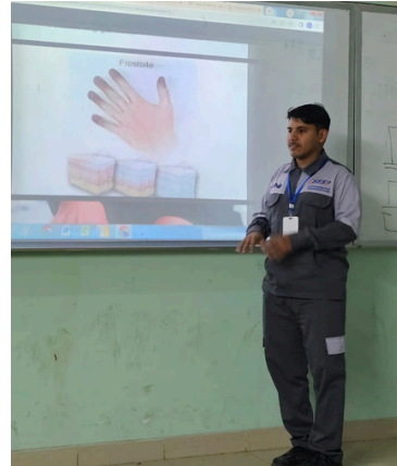
Scenes from the trainers' presentation of weekly safety tips and the students' participation to raise awareness of a positive safety culture.