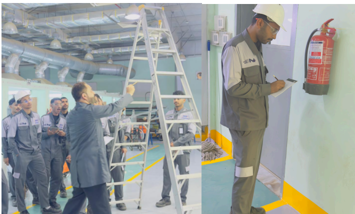
A scene from the safety inspection (Safety Walkthrough) conducted by the Beish instructors and students on workplace safety.