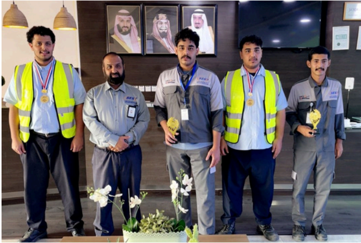
A scene from the honoring of Tamaruz Company trainees in Ju'aymah, the winners of the Baloot Championship.

Because we believe that our success is the result of teamwork, we love to share with you these behind-the-scenes moments that make our achievements possible.